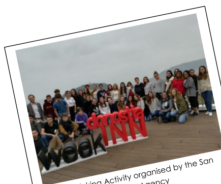
Design Thinking Activity organised by the San Sebastian Development Agency Nazaret Zentroa, San Sebastian, ES