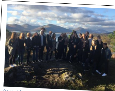
2-week language course in Edinburg, Scotland Knord (Lyngby), DK