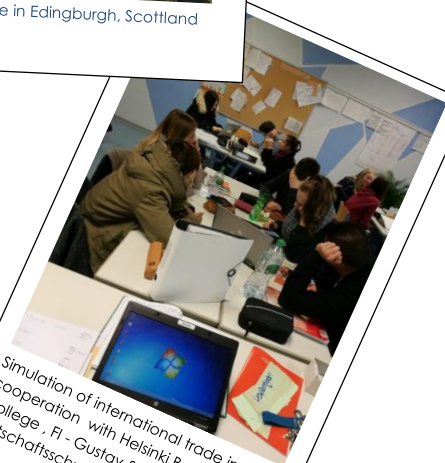
Simulation of international trade in cooperation with Helsinki Business College, FI - Gustav-Stresemann-Wirtschaftsschule Mainz, DE