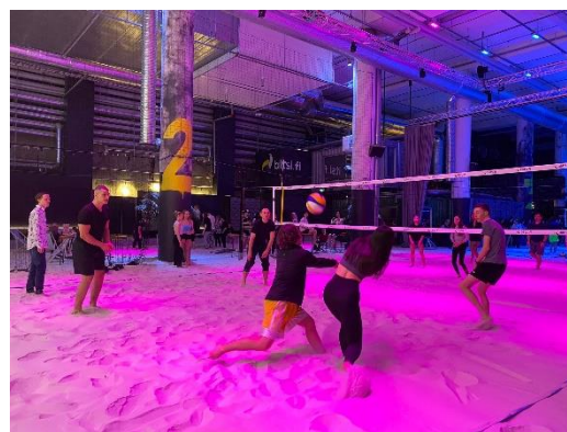
Beach volley and other games to get to know each other.