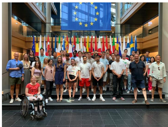
EBBD Class Meets Dutch Partner School in Strasbourg.

In their spare time, the students cooked together, played volleyball and organized a football tournament.