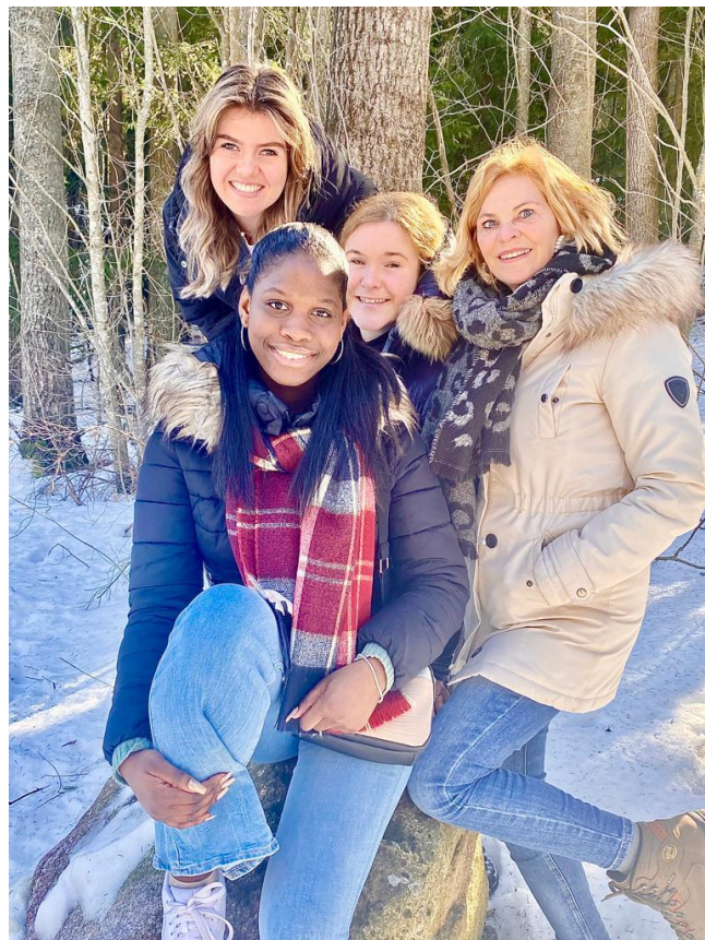
Dutch guests encountered Finnish trees.

The students of Business College worked together to prepare and host the visit of international guests, and thanks to the joint efforts, we managed to create a welcoming environment in which we all gathered beneficial knowledge on the topic of well-being and made a lot of new friends from all over the world!